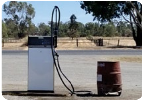
Old drums filled with concrete used as impact protection

Guidance is available in Australian Standard AS 4897 on how to store fuel in underground tanks safely (see Useful resources ).