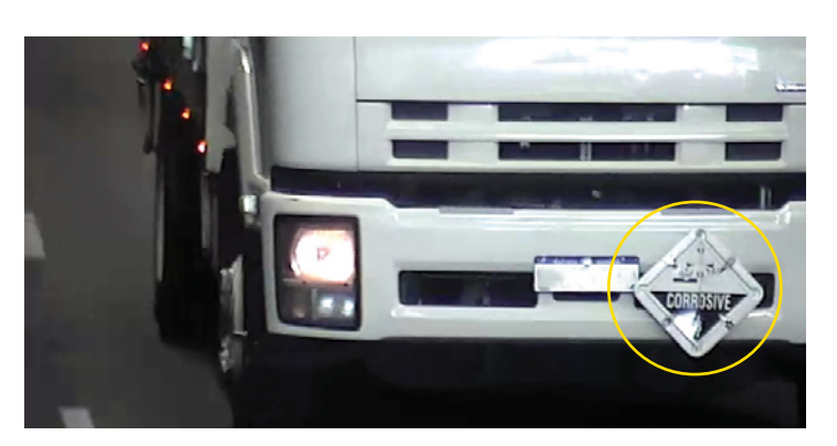
Example of a placarded vehicle. This vehicle must not enter the Northbridge Tunnel.

Pre-plan suitable routes Drivers should know exactly where to drive and, specifically, which lane to be in. For drivers not familiar with driving in the metropolitan area, including regional drivers, please