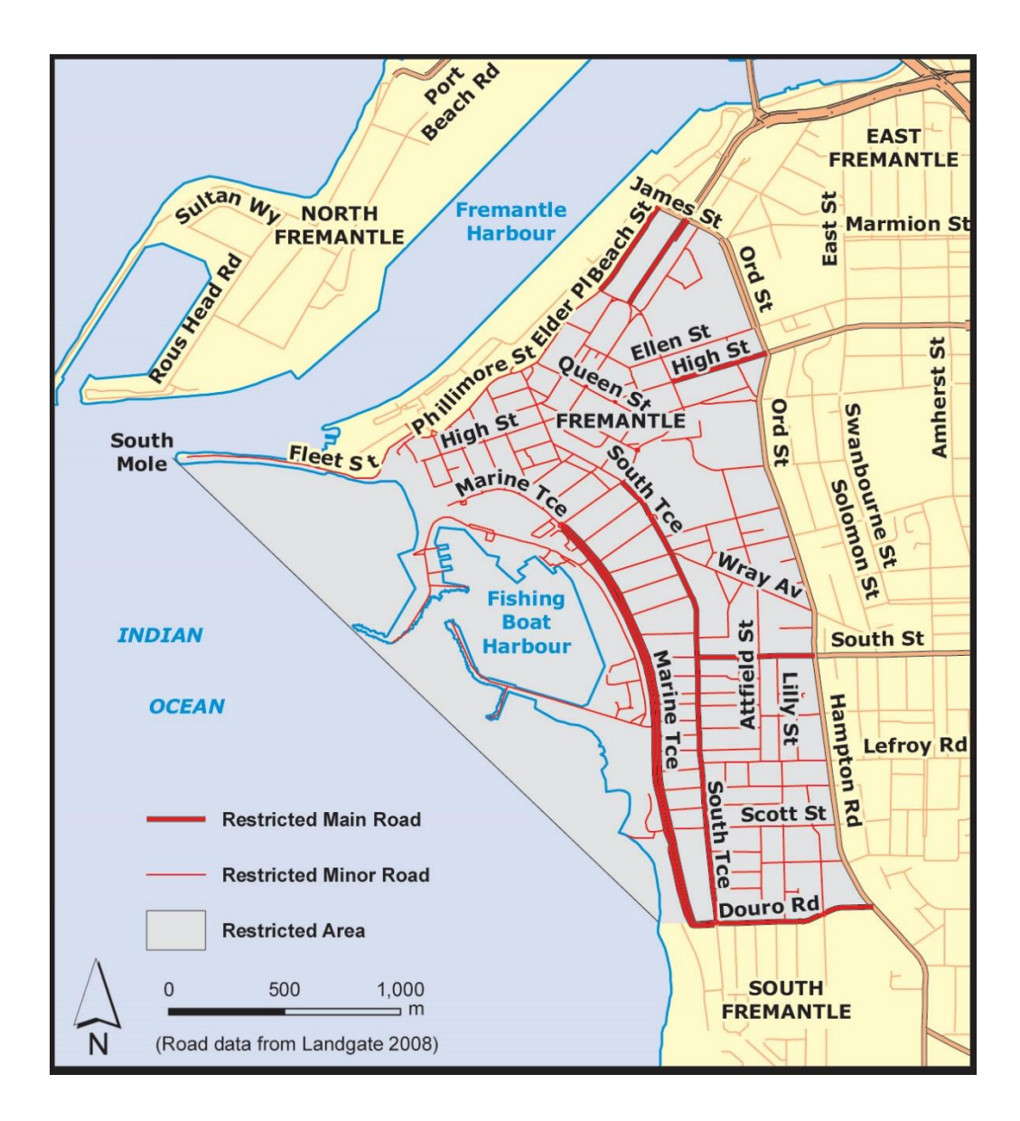
Figure 2 Restricted area boundaries for Fremantle CBD (grey shading, roads shown in red)